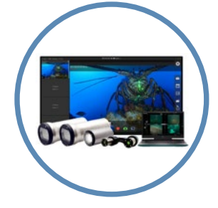
Subsea 4K & HD Video Survey