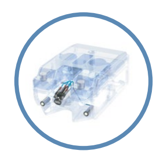
Subsea Digital Stills